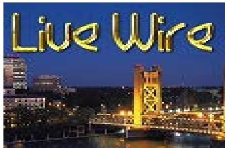
Local Access Sacramento Shows